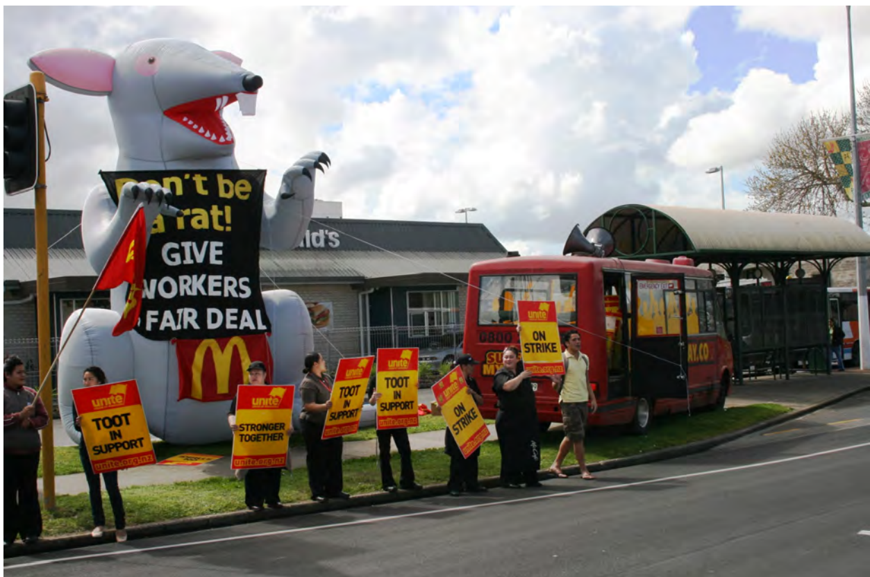
McD's strike 2008 - Otara

mediated by the Human Rights Commission for the anti-gay discrimination, but we are scheduled to have a mediation over the dismissal. We have also complained to the parliamentary select committee discussing the employment law changes because we