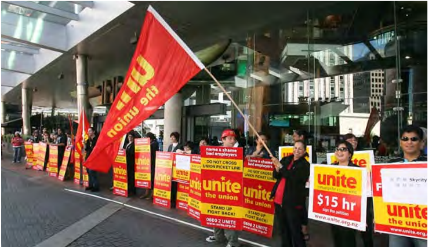
SkyCity Casino strike 2011