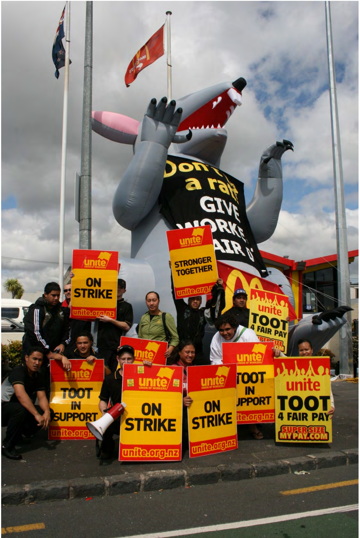
McD's strike 2008 – Grey Lynn