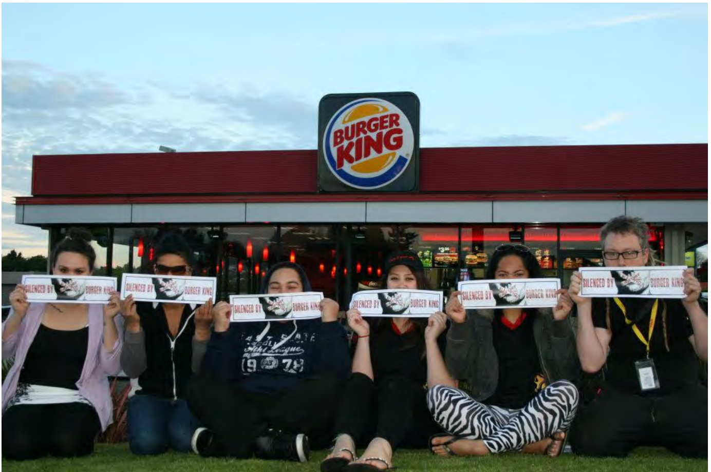
BK workers stage a silent protest in 2012 against attempts by the company to gag them for speaking out about how they are treated by BK.

issue other than to have some form of minimum guaranteed hours for staff – at least after an initial period of employment.