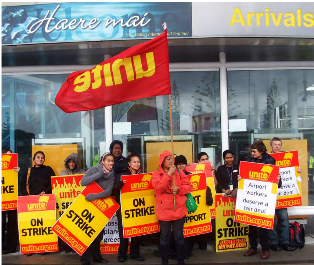
HMSC strike, Auckland Airport, June 2008

were seen as a better option to keep the company guessing. Casino staff would decide in small groups, department by department, when and where to take strike action, according to how busy things were. If the company got wind of an action and called in extra non-union staff, the action would be postponed. HR managers had to be billeted in the hotel 24-7 to manage the situation for the company.