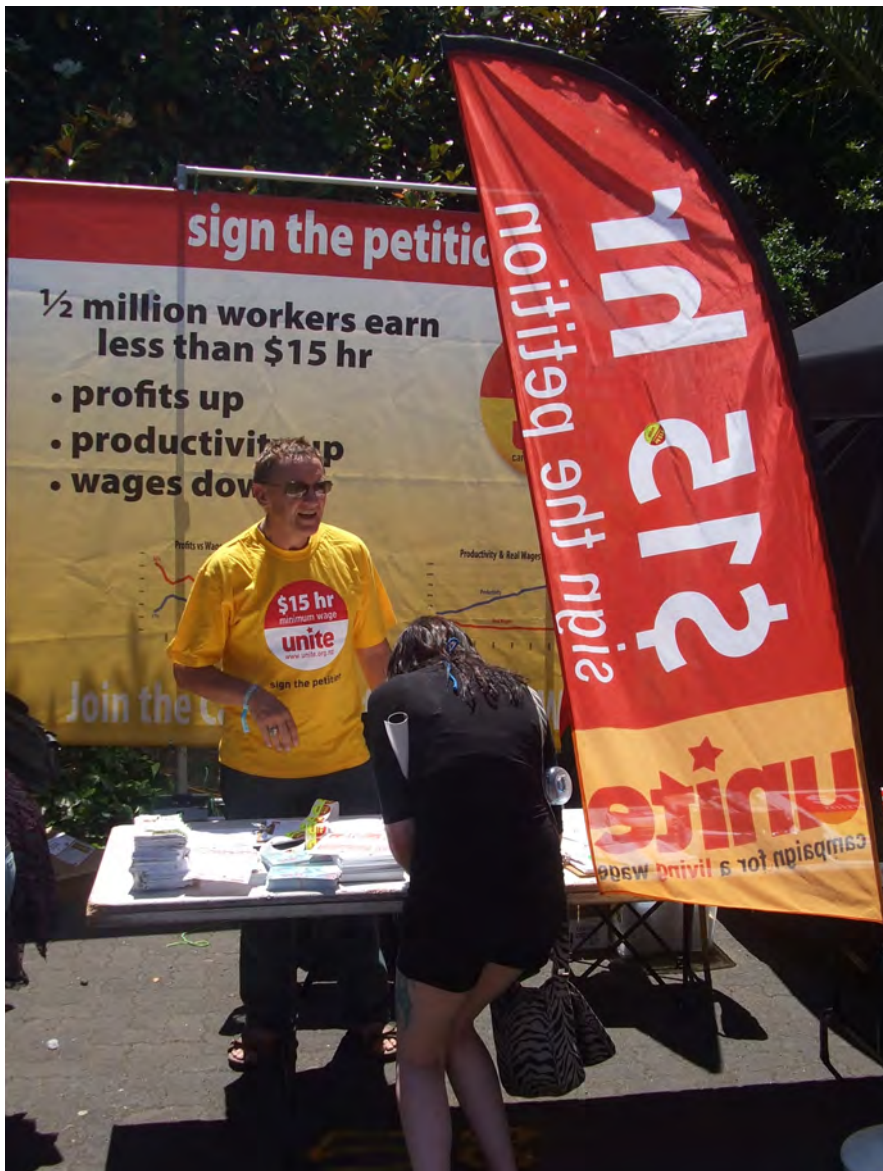
Petition drive by Unite in 2009-10 got 200,000 signatures for a $15 minimum wage

A major element on our side was the fact that the minimum wage was being increased strongly following the formation of the Labour-led government in 1999. The previous National Government of 1990-1999 increased the minimum wage only once. In real terms, it had declined from 50% of the average wage to 30%. The 1999-2008 Labour government restored its value to 50% of the average wage. The adult minimum rate went from $7 an hour in 1999 when Labour was elected to $12 when they left. The youth rate went from $4.20 an hour for youth up to 19 years of age to a "new entrant" rate of $9.60, which applied to 16 & 17 year-olds for three months. Unite was able to ride those increases across the period we have been bargaining with the fast food companies, whose start rates were governed by the minimum wage. Because of that fact, we have been able to count on above-inflation rate increases most years for the start rate in agreements. We could then focus on the gains in service, secure hours and breaks. Somewhat to our