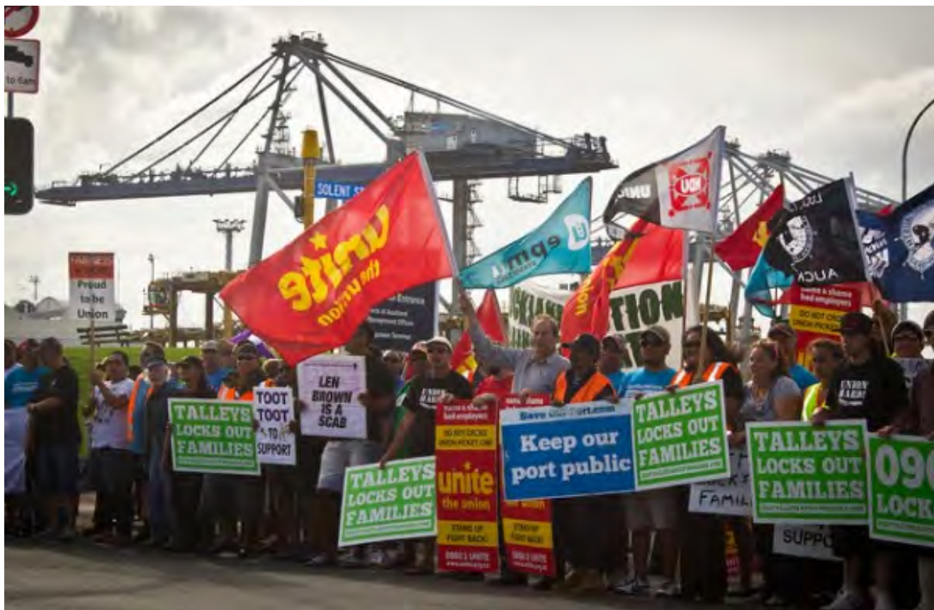
Unite joined the picket line in support of Auckland port workers in 2012

In November 5, 2008, we organised a strike in 20 stores in Auckland and Hamilton, and one in Wellington for the first time. A march was