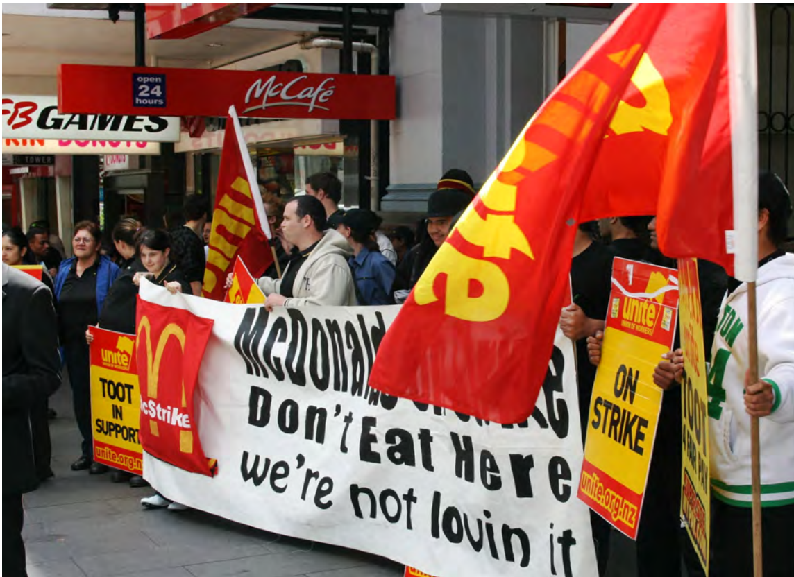
McD's strike 2008 – Queen St, Auckland

franchisee's store had also been told "don't act gay" or he would be disciplined. This threat became an international media event before it was reported in New Zealand. The worker was later sacked after supplying us the evidence during the dispute on unpaid breaks being missed and after he appeared before a parliamentary select committee on September 11, 2013 discussing the government's planned removal of many legal protections for breaks. He has received compensation from McDonald's