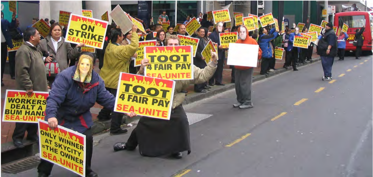
SkyCity Casino strike 2006

Unite also extended its representation with a hotel campaign involving strikes (and occasional lockouts) at a number of hotels in early 2007. The ADT-Armourguard monitoring centre struck on Christmas Eve – the busiest night of the year to secure an improved offer for a renewed collective agreement.