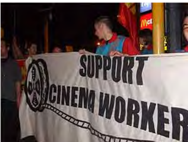
June 2008 cinema workers strikes

August through October 2008 saw three months of rolling strikes at the casino in Auckland by members of both SEA-Unite and the Service and Food Workers Union (SFWU) to secure a renewed collective agreement. With 1000 members, the two unions there still have only one third of the total staff employed. In these circumstances, it is difficult to shut the casino down through strike action. Guerrilla actions