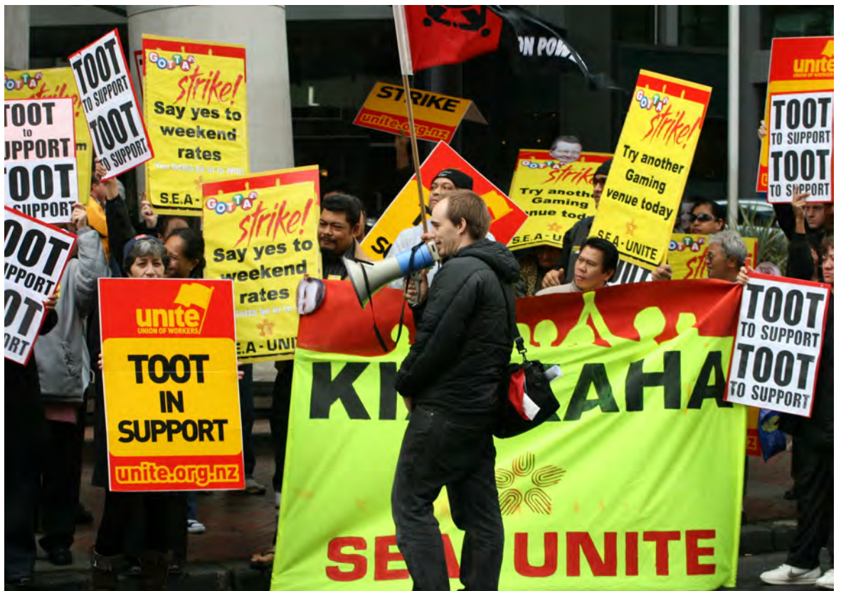
August to October 2008 saw rolling strikes at the SkyCity Casino

In late 2008, Unite launched a campaign to unionise the research company call centres operating in NZ. This was in response to an appeal from the Australian call centre union, the National Union of Workers. We succeeded in unionising most of them and getting collective agreements after some tough battles and a number