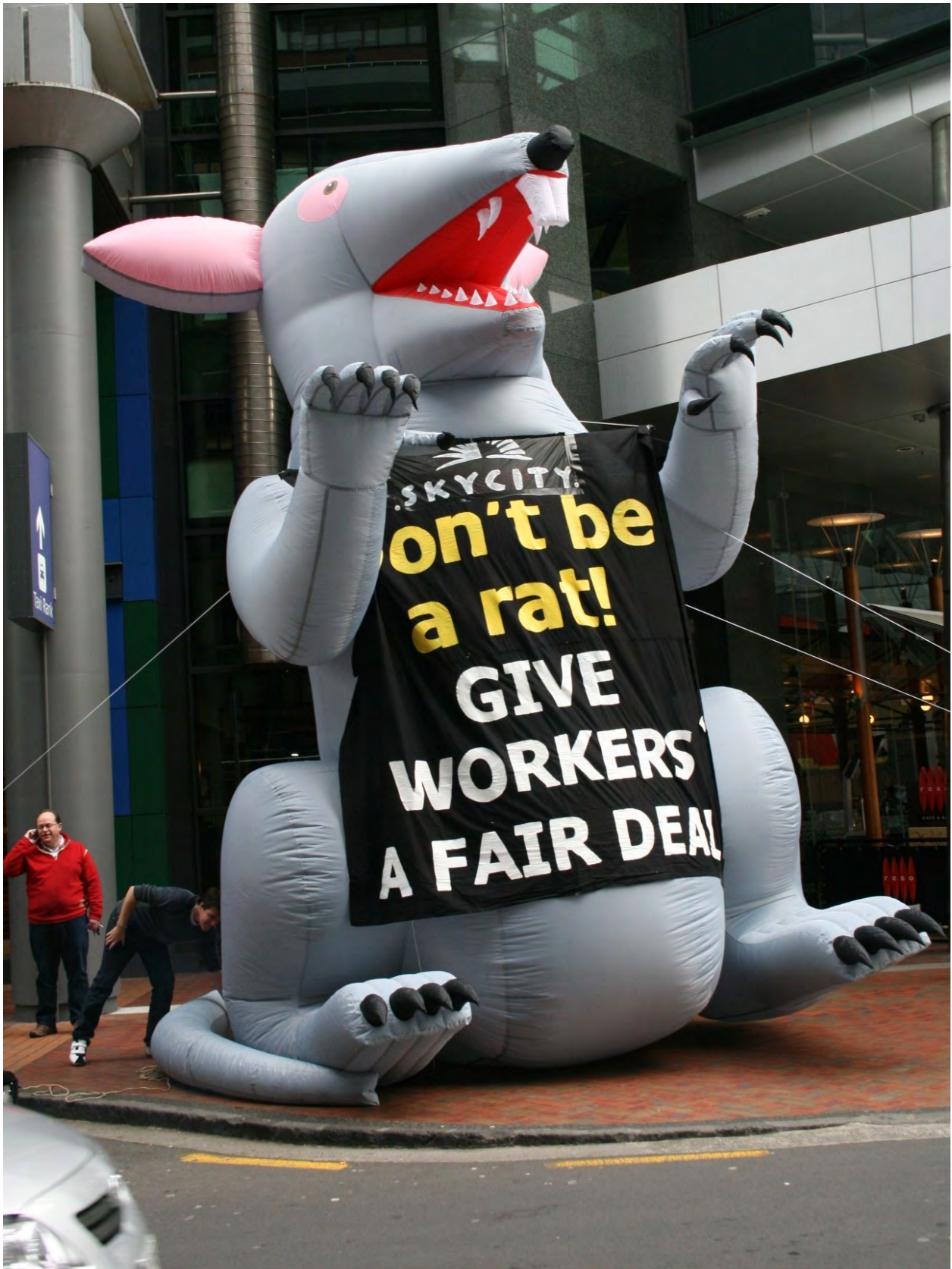
Casino boss in red top greets the rat in 2008

of strikes and lockouts. When we were locked out, we barricaded the doors so the company couldn't get in either. One set of negotiations went all night until it was settled. Today, most of the centres that became unionised have relocated to other countries or switched to computer-based home calling. But workers at other centres have joined Unite. The Vodafone call centre, for example, came on board, along with some direct-sales call centres.