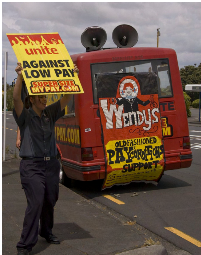
Wendy's strike for a collective in early 2007

In late 2006 and 2007, Unite unionised a factory owned by Independent Liquor at the request of some workers. This was a very anti-union employer. Strikes and pickets were needed to get a collective agreement, the first in the company for 20 years. After a while, however, we realised that we were probably getting beyond core business and agreed to allow the Engineers Union which covered workers in other liquor manufacturing plants to take over representation.