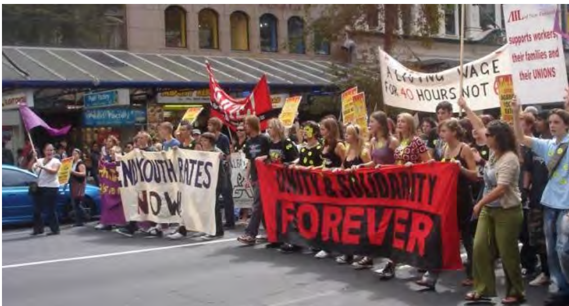
"Big Pay Out" protest, March 18, 2006

• March 18 was dubbed the "Big Pay Out" with strikes and a march of 1000 young people up Queen St, followed by a free concert in a park. McD's rostered union members off that day so they couldn't join the strike, so we recruited new members in the morning who could join the strike action. Four workers who had been in the union less than an hour led the first