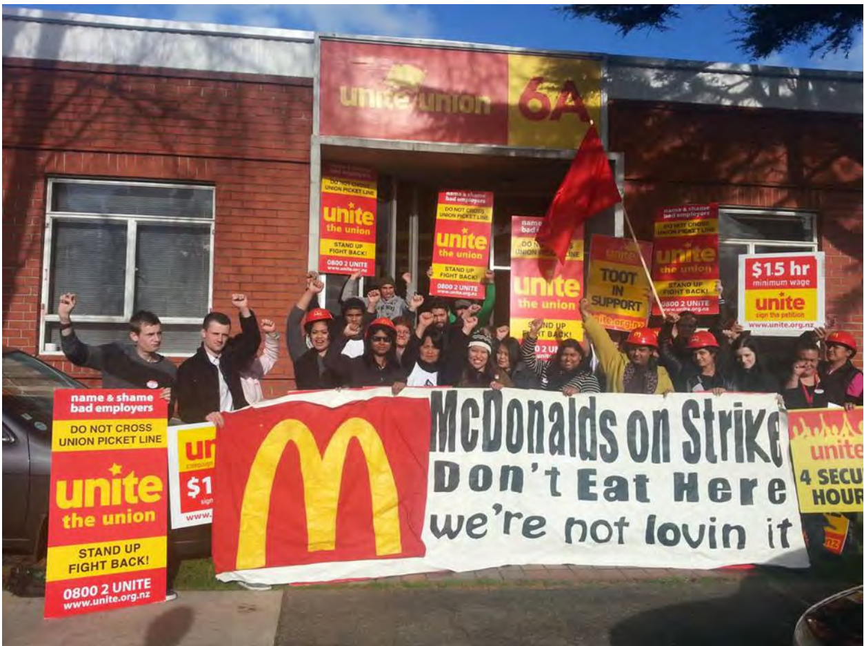
McDonald's delegate training day prior to negotiations in 2013 getting in a bit of practice