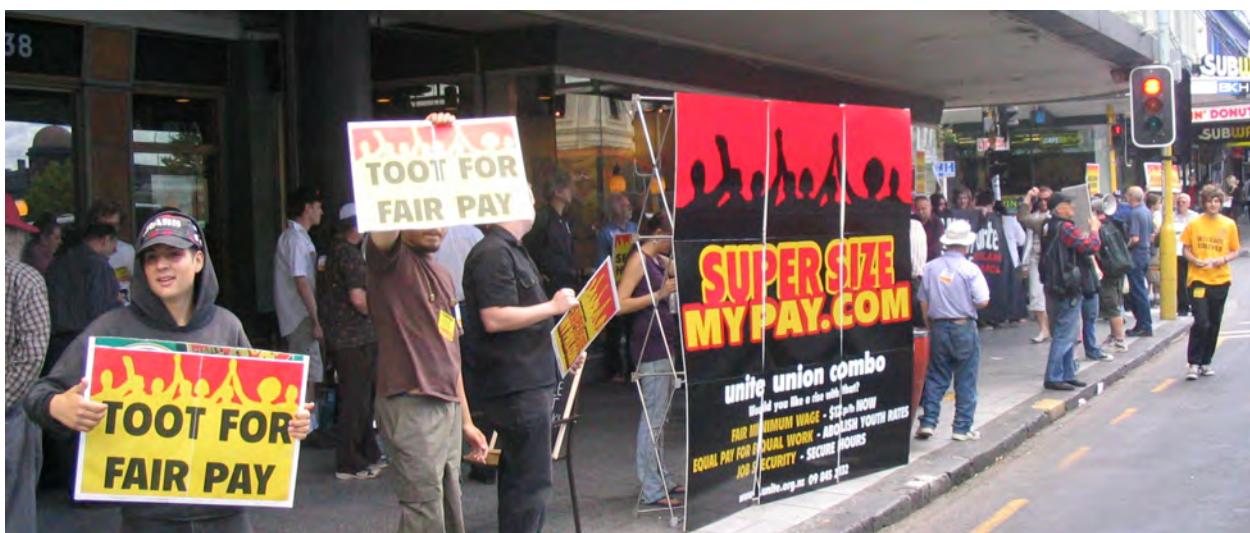
The world's first Starbucks strike, November 2005

Within a few months, one thousand fast food workers had joined Unite. The companies didn't know what hit them when the campaign was publicly launched on November 23, 2005 with "the world's first Starbucks strike". We decided to do Starbucks because it would be the company where Restaurant Brands would think we had the least chance to convince workers to go on strike. Partly because of store locations, the staff tended to be bit more middle class and trendy. On the morning of the strike, the