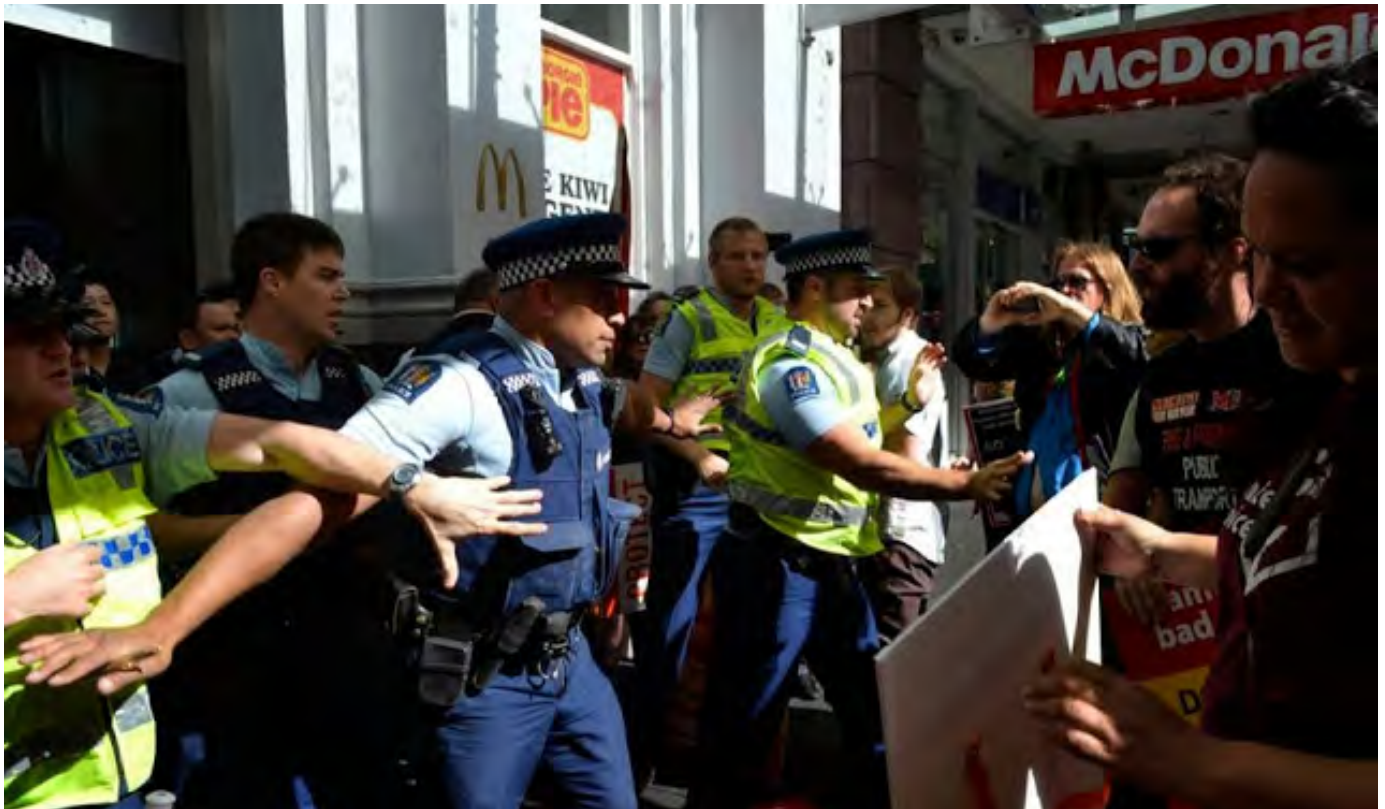
Police provide free security for McDonald's during 2013 dispute. They lose their discounted food as a consequence.

One significant advance from the union's viewpoint is that for the first time, the collective agreement is a completely different document to that of the individual employment agreement used by the company. It is also half the length without the company propaganda.