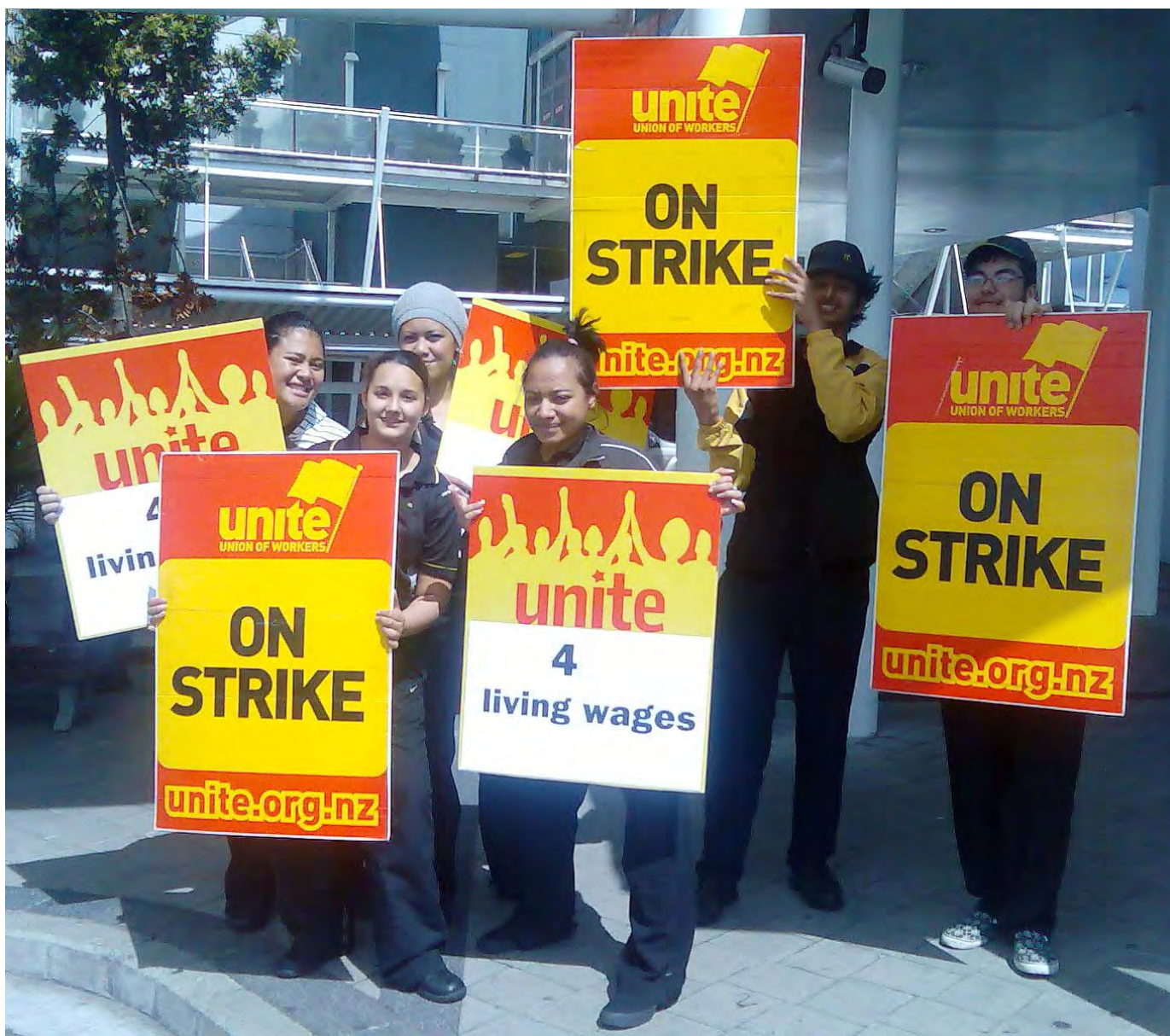
McD's strike 2008 – Auckland Airport

In 2013, we were determined to close the gap and