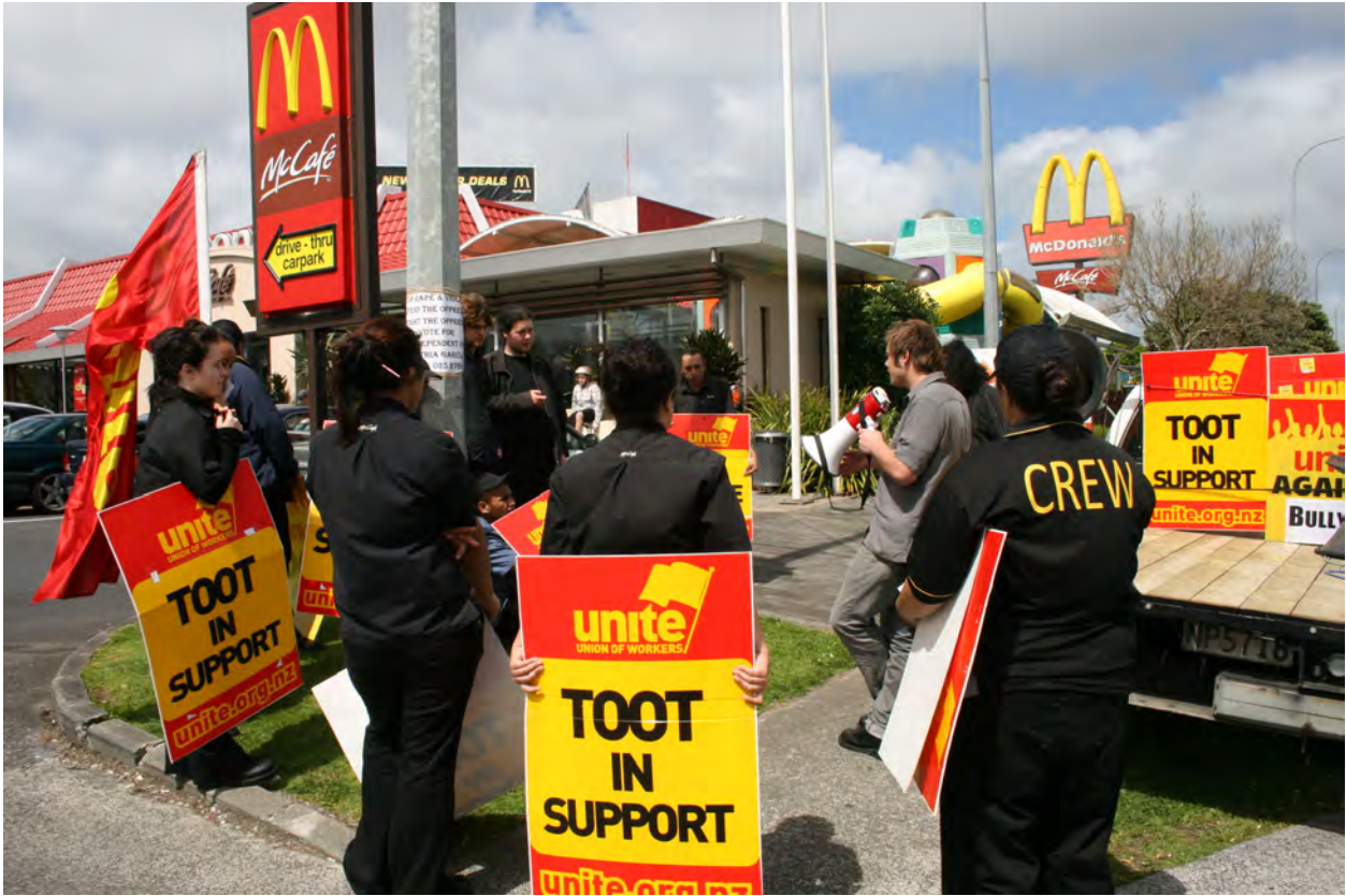
McD's strike 2008 – Lincoln Rd