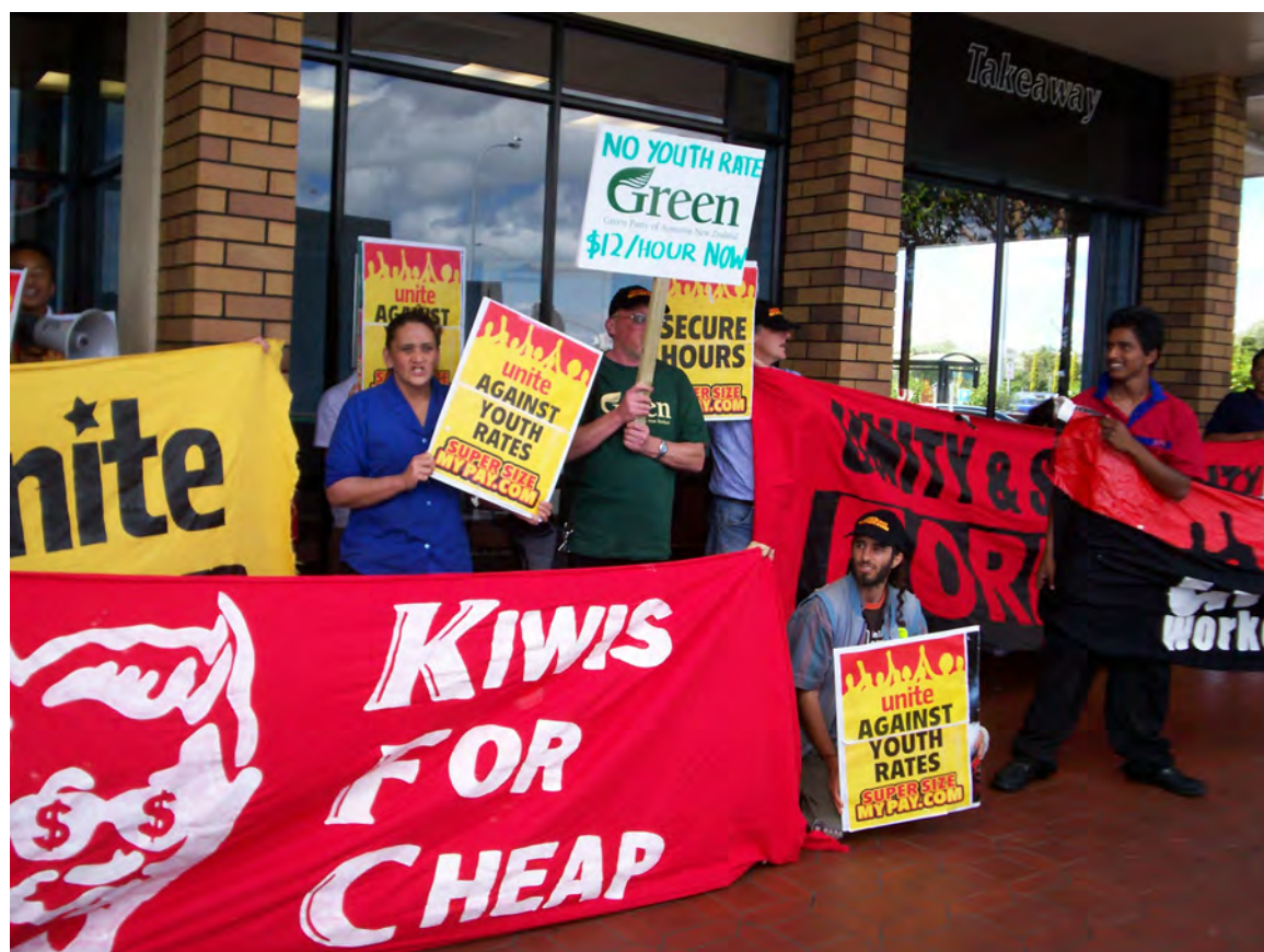
Lincoln Rd KFC strike, early 2006

starting in December 2005 with a strike at the newly renovated flagship Balmoral store led by a strike committee of workers on youth rates.