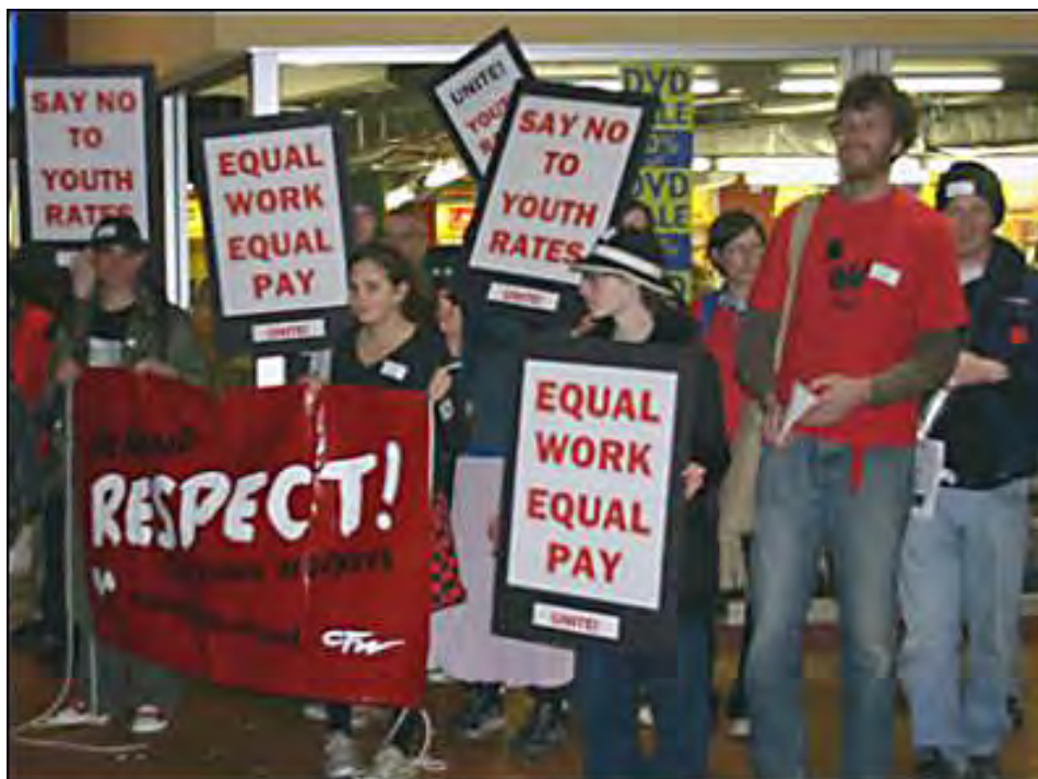
Popcorn strike outside Readings Cinema in Wellington 2002

During 2005, a number of workers from the SkyCity casino in Auckland joined Unite. Accepting this group as members was the most difficult and controversial decision of Unite because another union had a collective agreement with the company. Luckily, our newly established presence helped lead to union membership as a whole expanding, to a