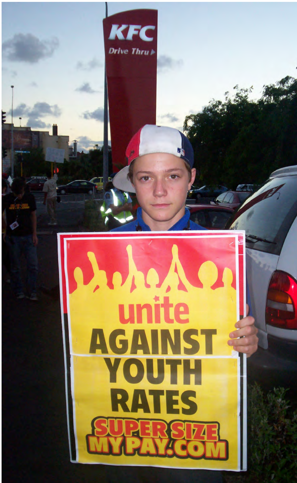
Balmoral KFC was the centre of anti-youth rates strikes in 2005-6 lead by majority teenage strike committee

strike at downtown McD's to march up Queen St, stopping at each store on the way.