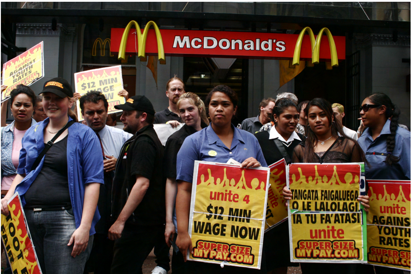
First McDonald's strike at their Queen St store in central Auckland, February 2006