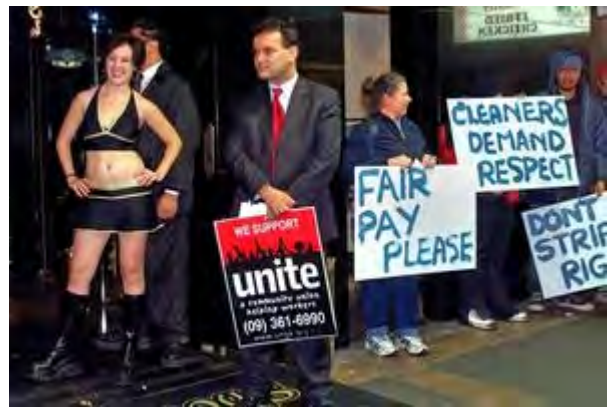
Unite picket outside brothel 2003

Publicity led to us being noticed and called up by workers wanting union representation. Two call-centre